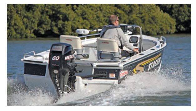
The Mercury BigFoot 60hp EFI four-stroke gets the Stacer 459 Barra Pro up and running smartly and runs on the smell of an oily rag.

Purchased complete with boat and trailer registrations and delivered on a Stacer TO48VBHW single-axle trailer with skids, this package can be towed easily behind a medium-sized car. At just over 5m total length, finding a location to store your pride and joy will be easy, too. It's easy enough to launch and retrieve singlehandedly, so there really is no excuse not to go fishing if you're lucky enough to own one of these. - Dan Trotter