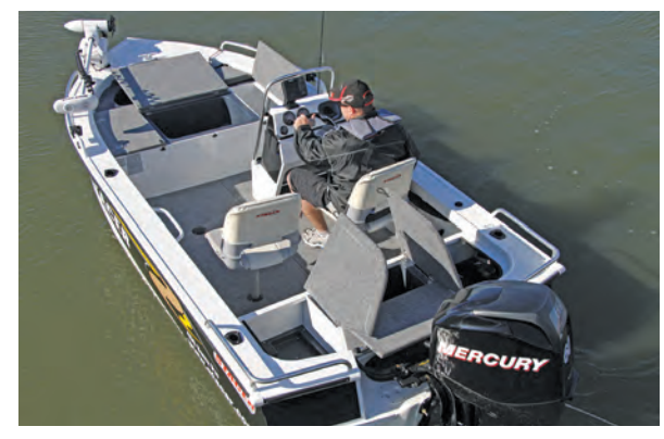
Open up those hatches and there's room for any amount of tackle, clothing, tucker and fish.

All in all, you will find it hard to beat the shelteredwater fishing capability and the quality of design and build delivered by the team at Stacer, especially for the amazing drive-away price of