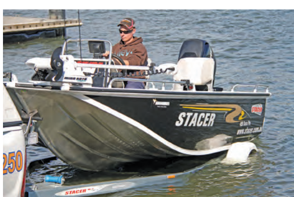
Left: There's storage galore and it's all down below those clean, uncluttered decks. Right: The Stacer 459 Barra Pro can easily be launched and retrieved solo or you can drive it on the trailer.