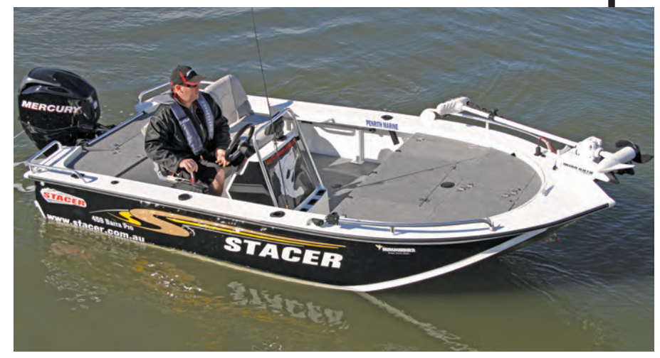
There's plenty of room for two or three to stand and cast in comfort aboard Stacer's 459 Barra Pro.

The 459 Barra Pro is decked out with sturdy hatches and hinges over well-planned storage compartments under the