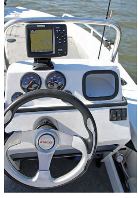
Left: There's plenty of room for the house battery, filters and more in this locker. Right: The dash displays all the instruments and electronics in plain sight and all controls fall to hand. And there is storage for all sorts of knicknacks.

built into the front of the console will safely house four outfits, while a further four gunwale mounted rod holders are positioned to provide options for trolling or bait fishing.