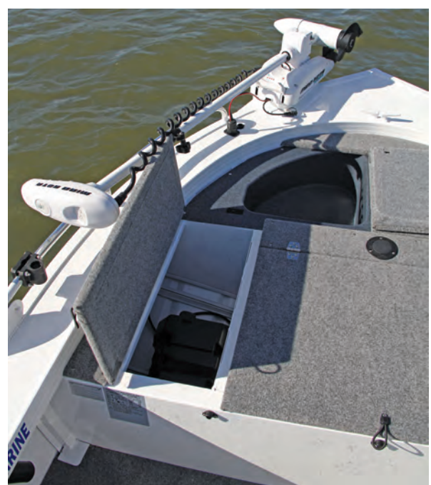
There's an anchor well forward and bolted to the bow is the latest 'electric' anchor – the Minn Kota RT55ST Terrova iPilot.

Test boat courtesy of Penrith Marine, 4/133 Coreen Ave, Penrith NSW 2750, ph: 02 4731 6250, web: www.penrithmarine.com.au.